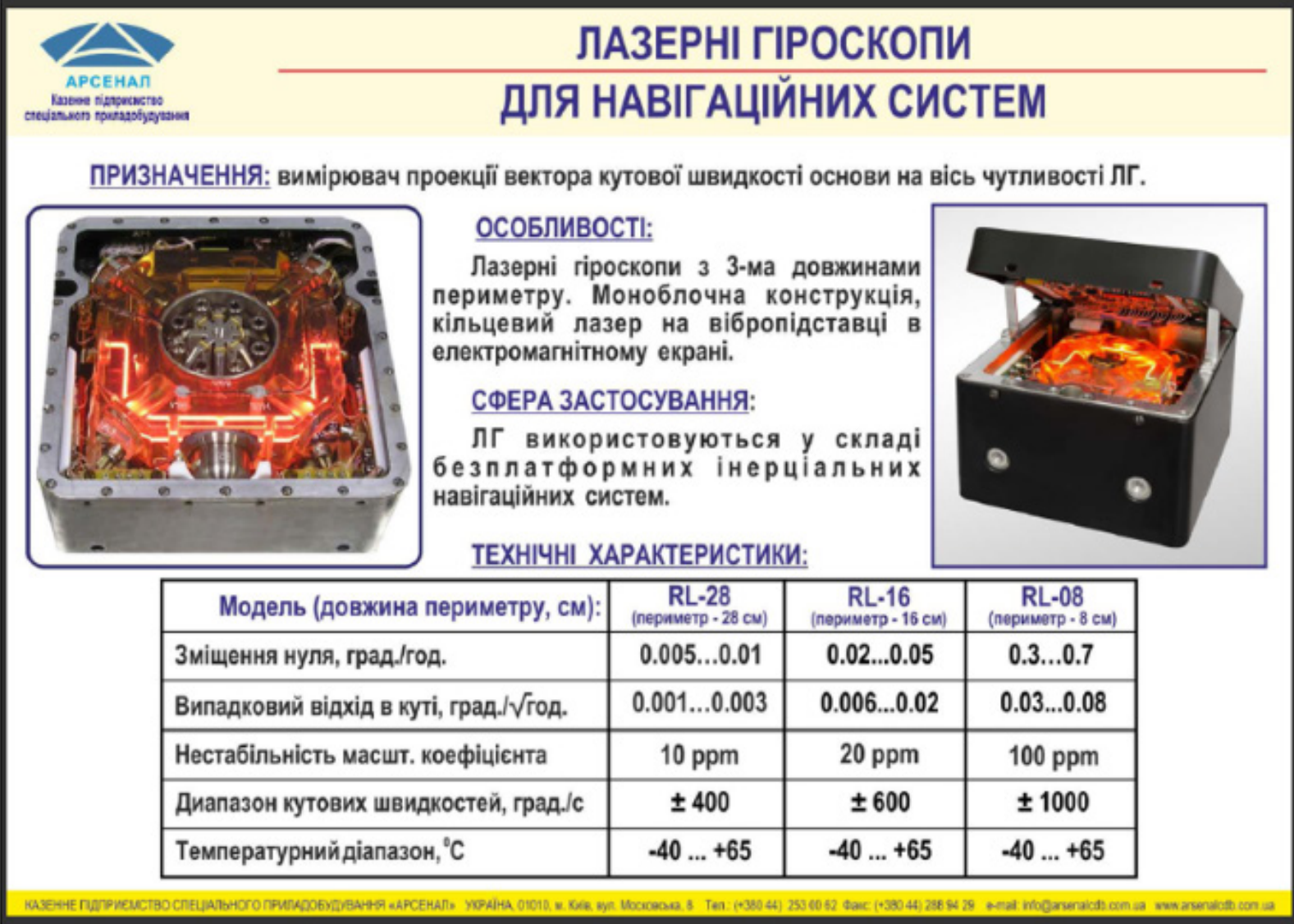
Decoy document about a ring laser gyroscope

Interestingly, that discovered version of CredoMap doesn't use the IMAP protocol for data exfiltration anymore. Instead, it leverages free legitimate services such as free.keep.sh and tiny.cc .