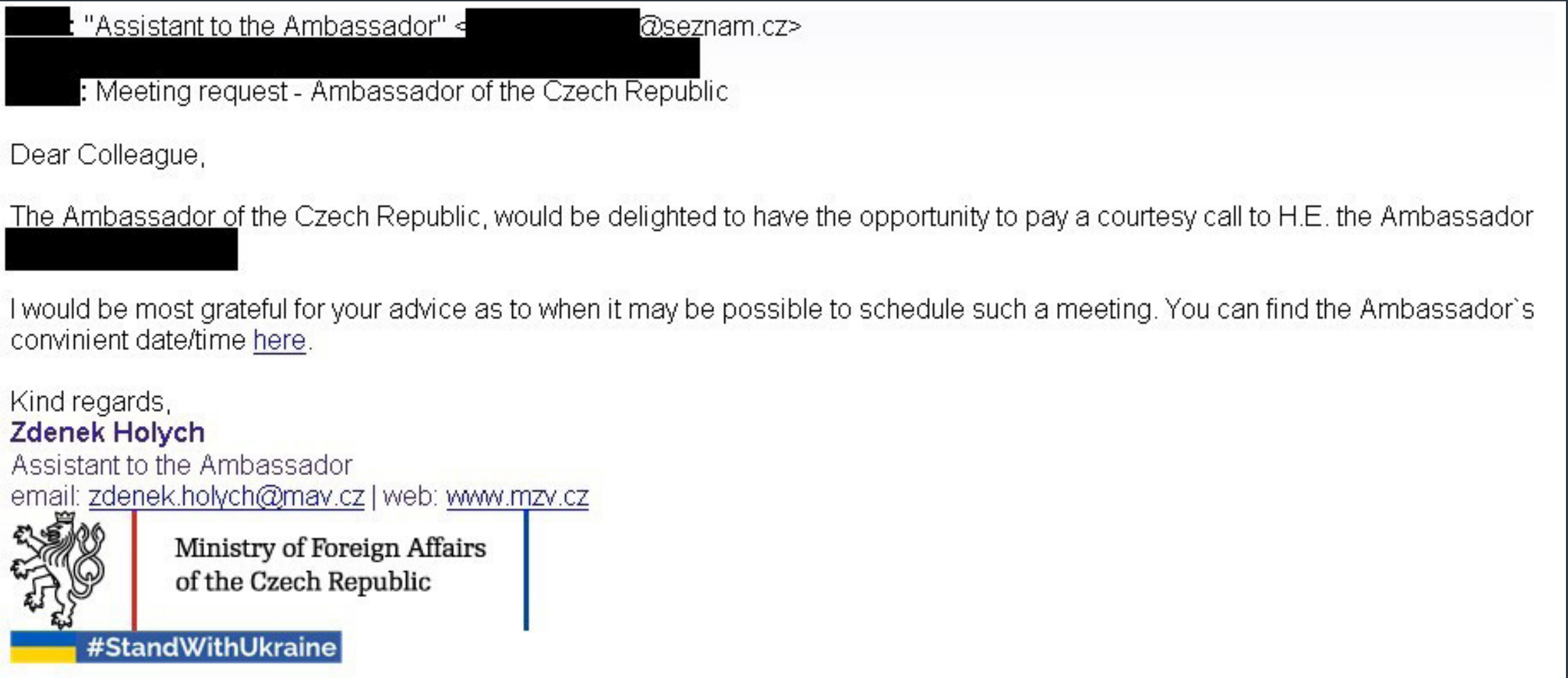
The Dukes' spearphishing email

The ZIP archive contains an executable vulnerable to DLL search order hijacking, and a side-loaded DLL. This DLL is a downloader that uses Notion [22] as its C&C server. We observed that this chain leads to in-memory execution of a red team implant known as Brute Ratel.